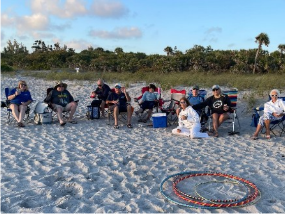
Sunset/Moonrise at Manasota Beech