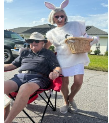
The Easter Bunny showed up at the Food Truck Event