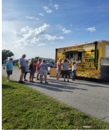
Street Harvest Food Truck